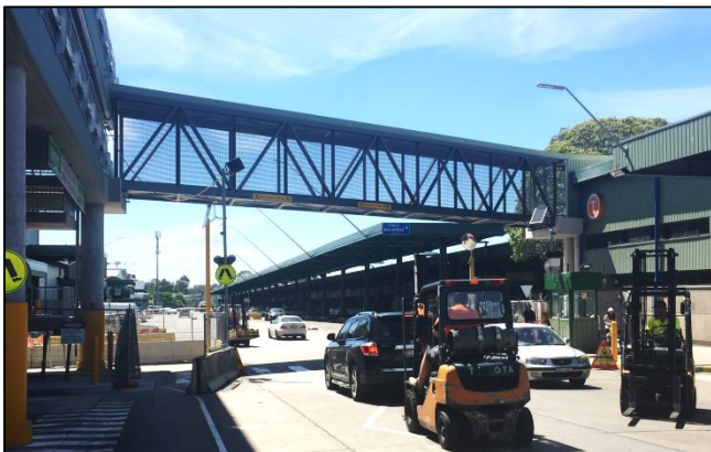
New footbridge across South Road

The footbridge leading from Flemington Station to the Markets has been opened and provides significantly improved safety. The footbridge prevents pedestrians from crossing South Road at ground level. With fewer people now using the pedestrian crossing, traffic flow on South Road has also improved.