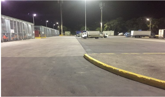
New 30m light towers in the Eastern Open Car Park

Energy efficient 490W LED Pierlite flood lights are now used instead of 1000W metal halide lights which needed to be replaced every two years.