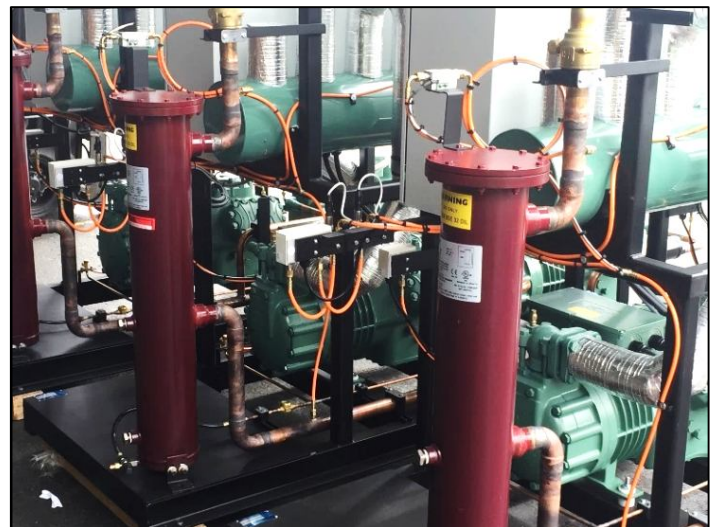
New Cold Stores refrigeration plant

Similar to the Main Plant, fine tuning to the Cold Stores refrigeration plant will be undertaken in the coming months during the commissioning process.